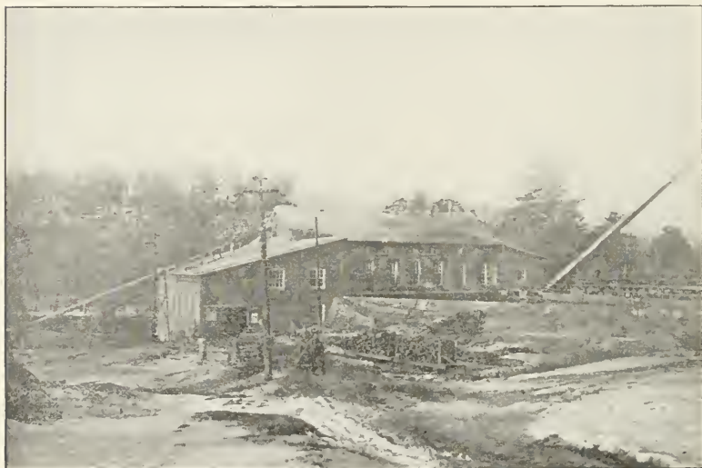
Wood Pulp Mill of E. I. Dupont de Nemours & Co., Newhall